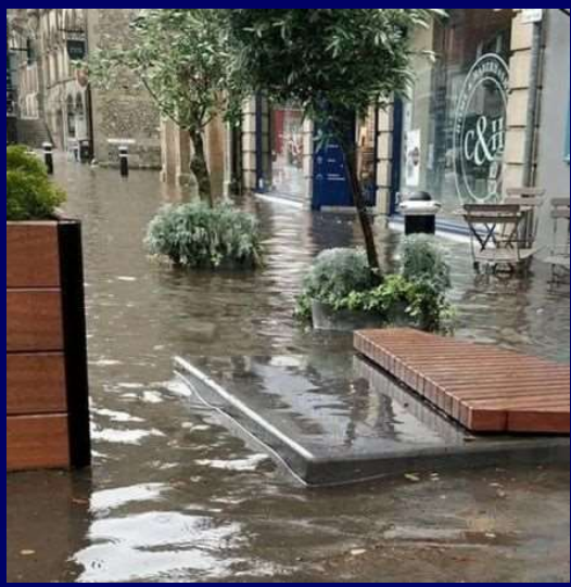
Lower High Street